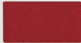
Dark red (optional)