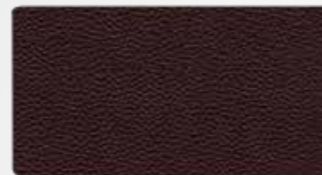
Dark brown (optional)